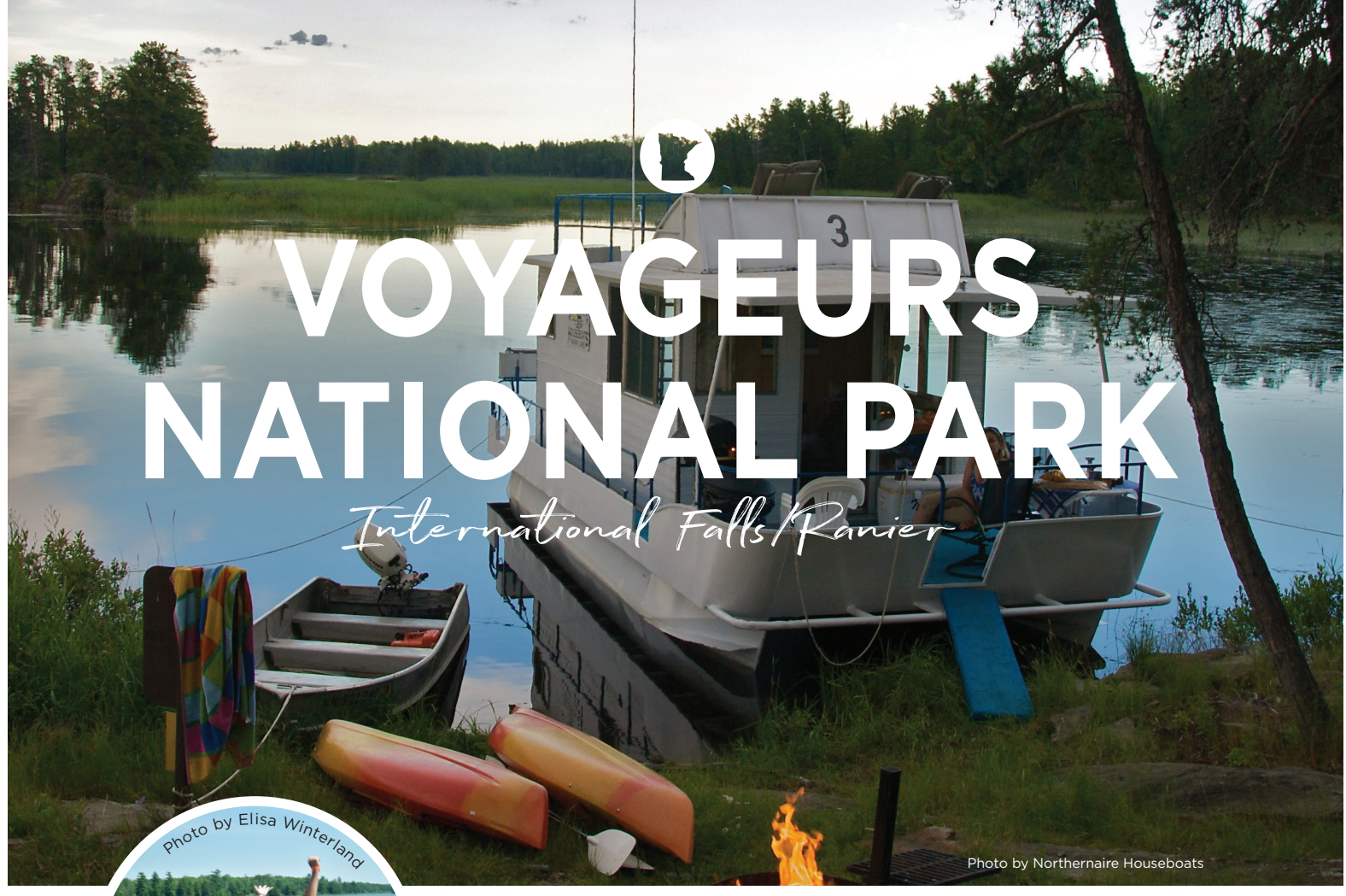
Article by International Falls, Rainy Lake, and Ranier Convention and Visitor's Bureau

Rainy Lake has legendary status in northeastern Minnesota. The spectacular scenery, rich natural resources, and vibrant history of the area prompted the establishment of Voyageurs National Park.