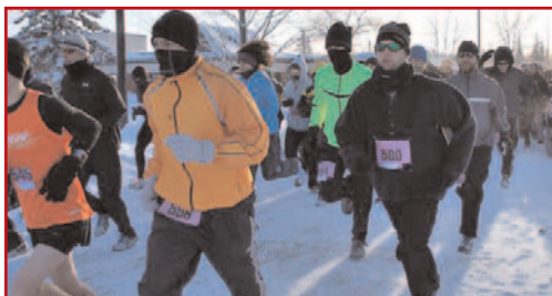
Runners of the FYGBR

Call 1-800-325-5766 or 218-283-9400 or register at www.freezeyergizzardrun.com