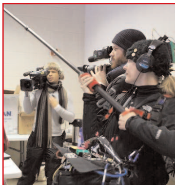
Above, film crews in 2011 Below, the Smoosher's gear